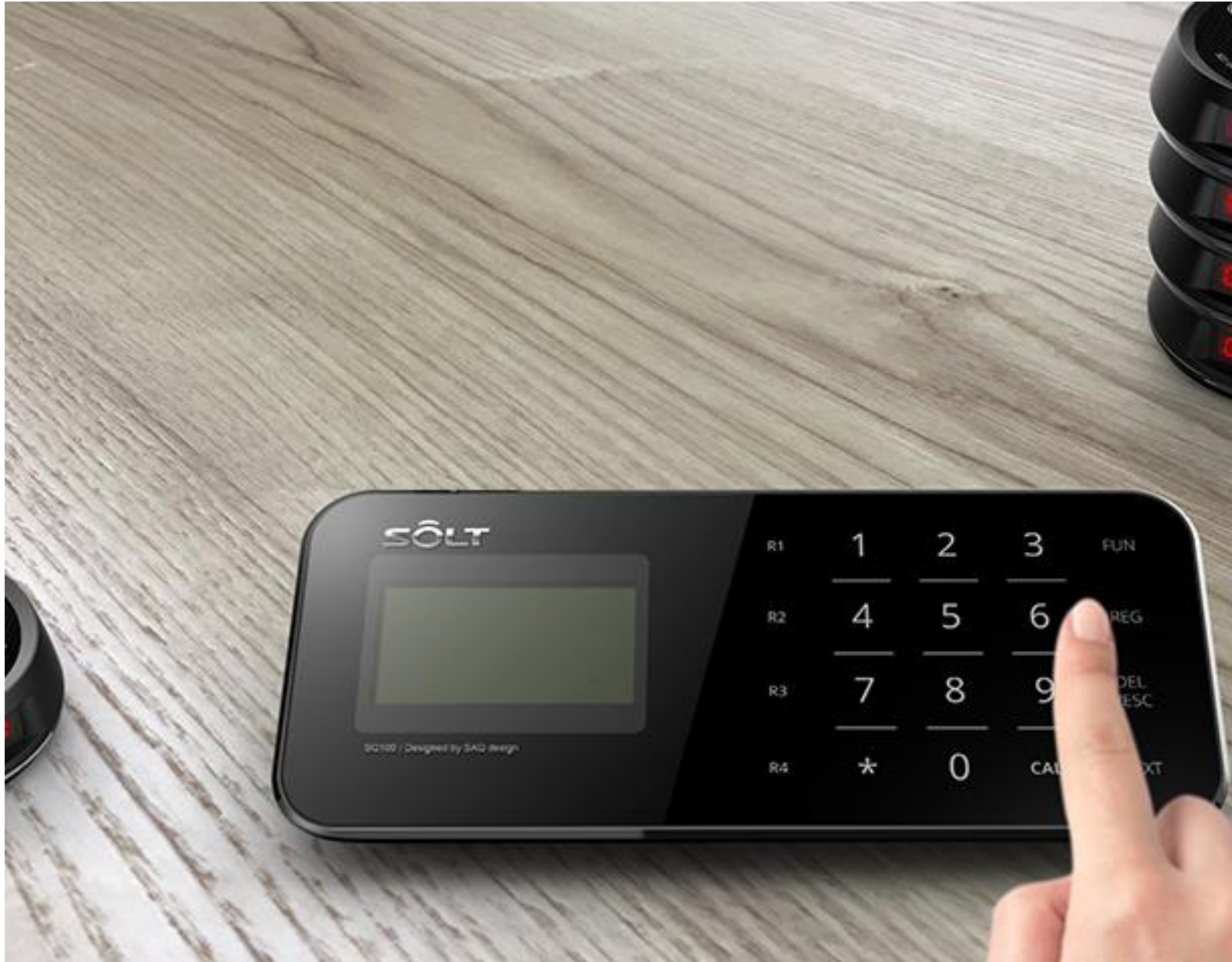
Sophisticated digital image - Piano-black color, mobile-phone rate shape, glossy edge, roundish corner