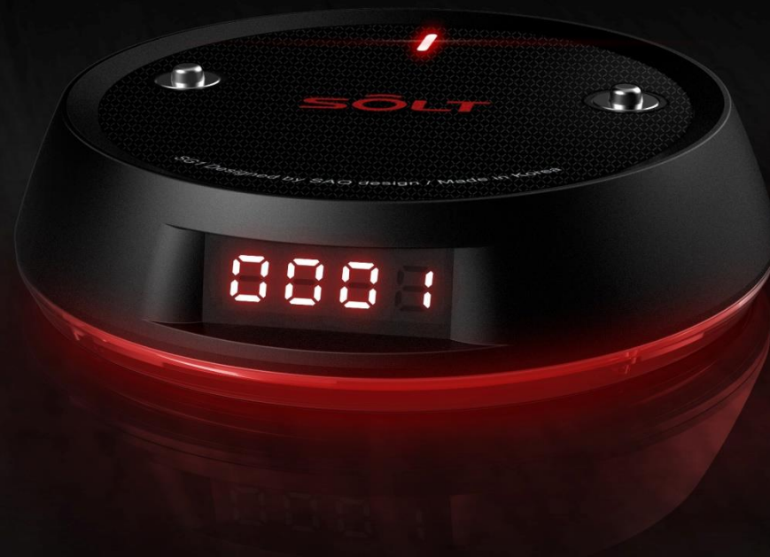
Image of spacecraft using transparent bottom and levitation feeling, Top and bottom Dual-LED lighting Indicators